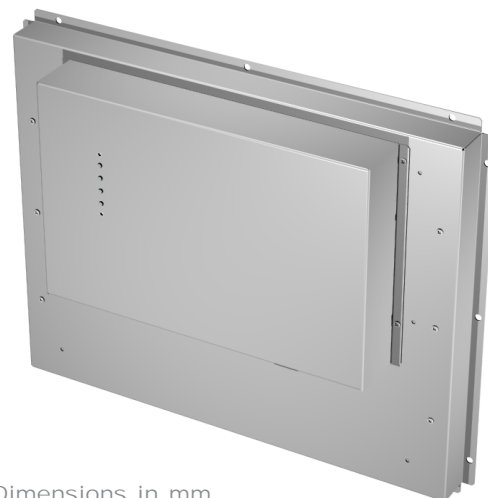
Dimensions in mm

All rights reserved. Specifications subject to change without prior notice